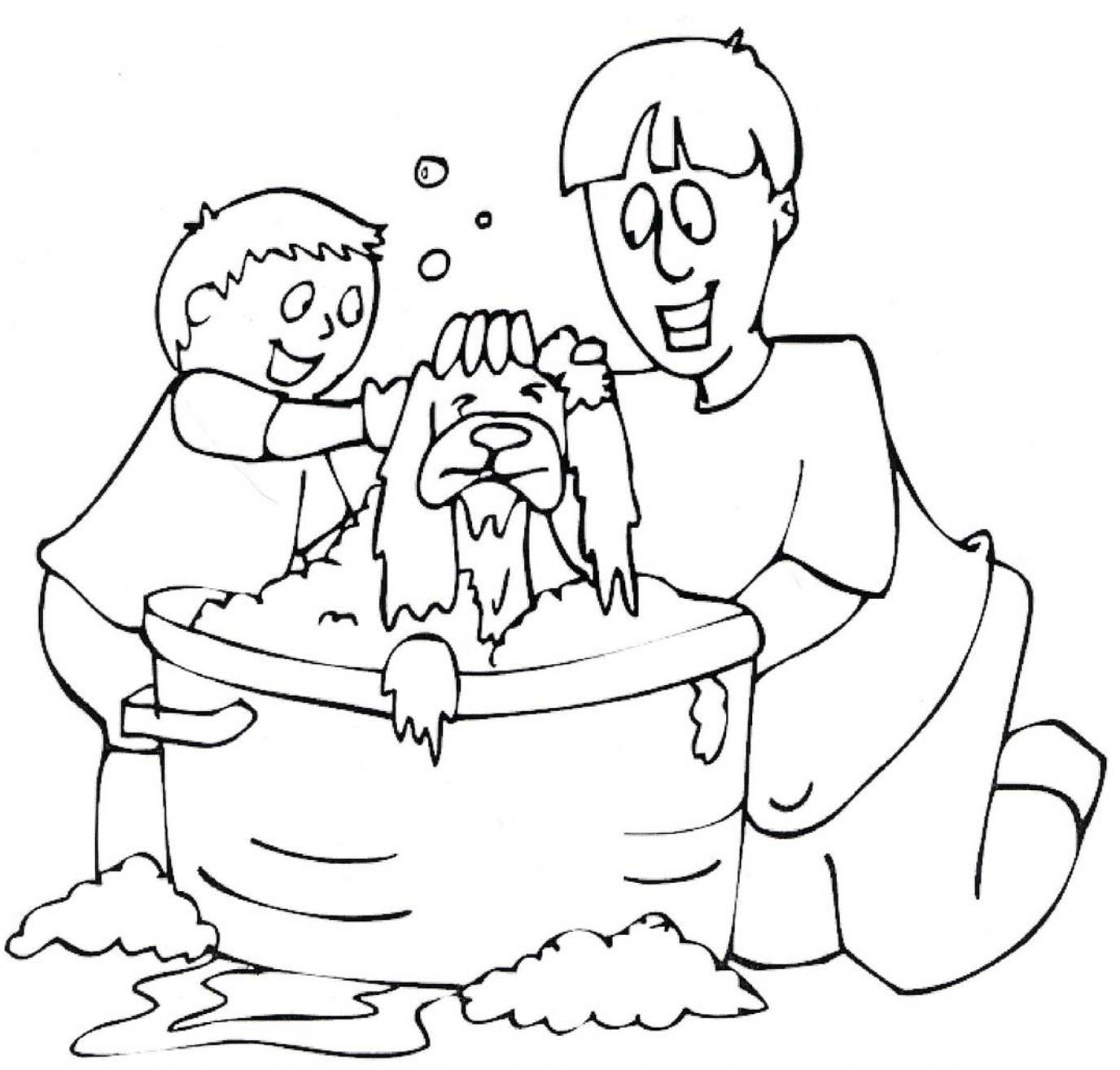
© Copyright by Preschool Education / Preschool Coloring Book, Visit <a href="https://www.preschoolcoloringbook.com">www.preschoolcoloringbook.com</a> for more coloring pages.